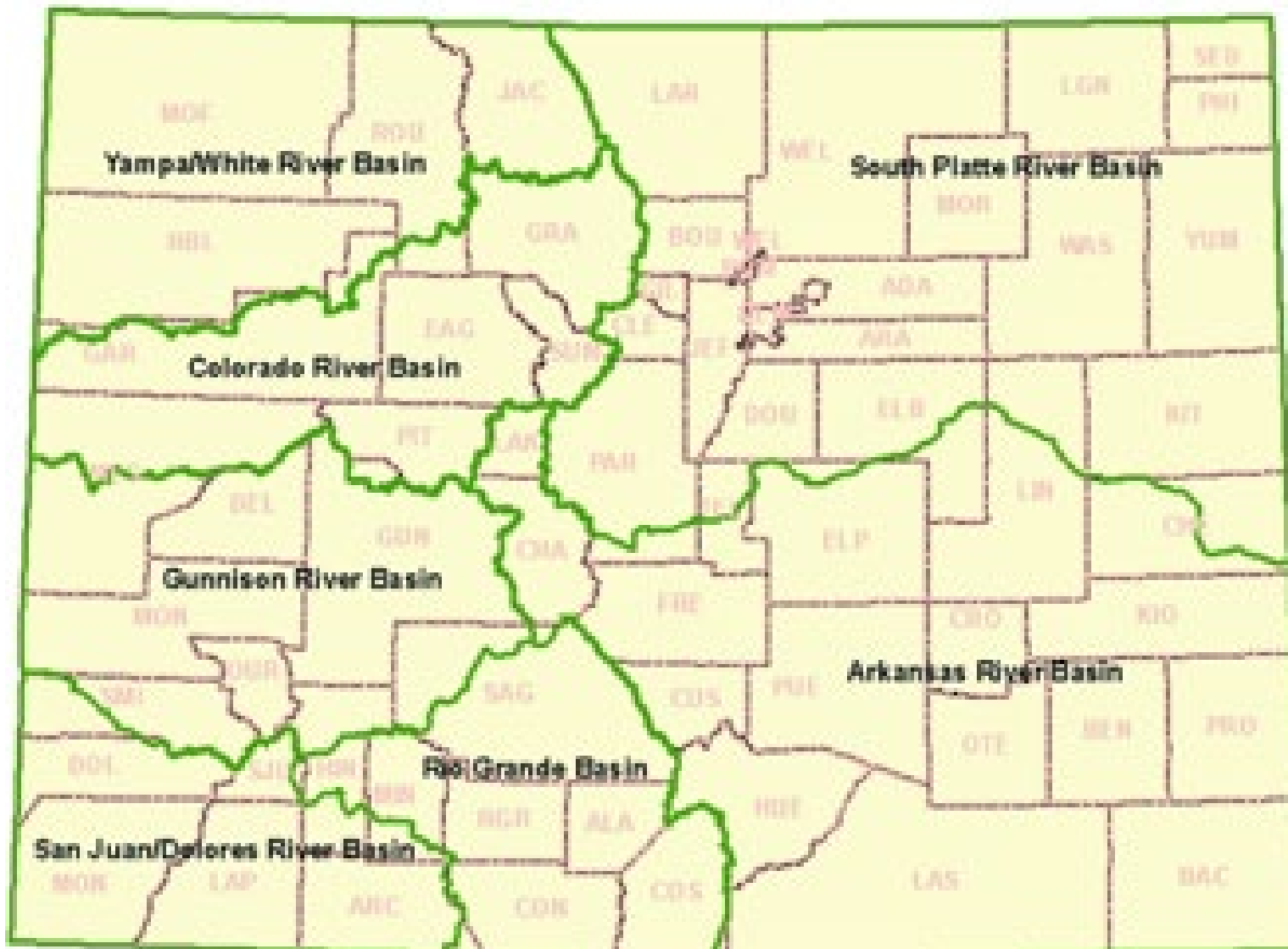
COLORADO DIVISION OF WATER RESOURCES